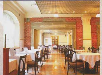
European style cuisine (Nakanoshima Club)

Aquapolis, Osaka, also known as the Venice of the East, offers cruises and waterside restaurants where you can savor the waterside scenery while you eat. The gently flowing water and delicious food create a luxurious dining experience. You can fully enjoy the two different charms Osaka has to offer; gastronomy and water.