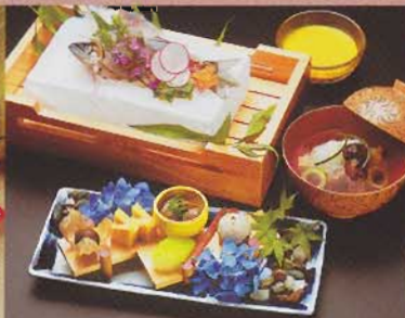
Japanese cuisine (Aloro)