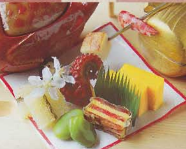
Japanese cuisine (Kagairo)