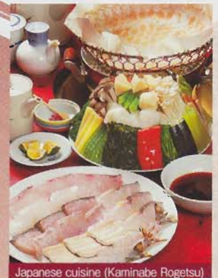
Japanese cuisine (Kaminabe Rogetsu)