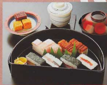
Osaka-style sushi (Sushiman)