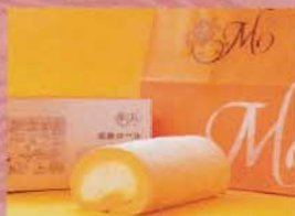
Roll Cake (Mon Chou-Chou)

Osaka has many of the leading "ryoteis" of Japan. Ryotei refers to a high-class Japanese restaurant. You can savor flavorsome cuisines made by skilled chefs, while you take in the aesthetic charm of an old establishment. Enjoy cuisines that are also delightful to the eye such as "kaiseki", which was originally served before a tea ceremony, and Osaka-style sushi, which takes a great deal of time and effort to prepare.