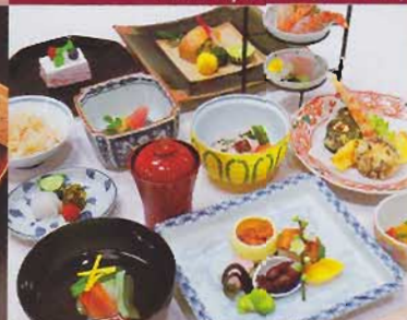
Japanese cuisine (Edobori Yamaguchi)