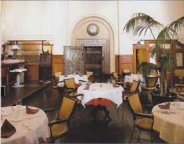
French & Italian cuisines (Sakaisuji Club Ambrosia)