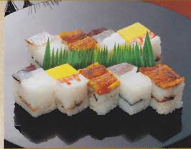
Osaka-style sushi (Yoshino Sushi)

Sushi in general comes in the form of nigiri topped with a slice of raw fish. Osaka-style sushi is made by placing the sushi rice and the topping in a mold. Every topping is either cooked or seasoned such as vinegar marinated mackerel and omelet. It is unique for its flavor improves as it matures.