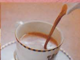
Chocolates (Ek Chuah)