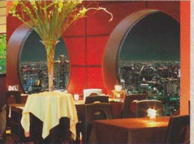
Chinese cuisine (Sangu)