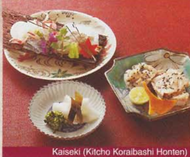
Kaiseki (Kitcho Koraibashi Honten)