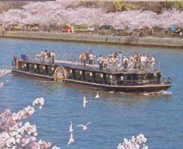
French cuisine (Gourmet Music Boat, Himawari)