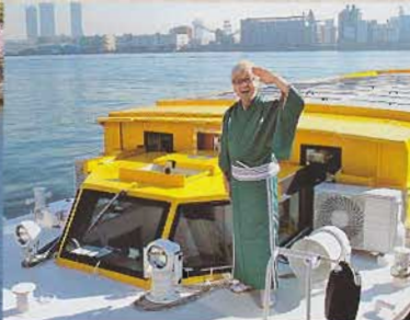
Taiko Bento (Rakjogoka To Iku Naniwa Tanken Cruise)