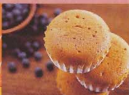
Pastries (Gokan Kitahama)