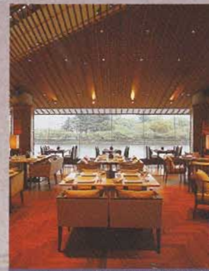
French cuisine (River Suite OSAKA)