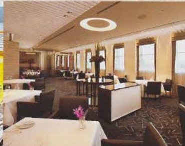
French cuisine (Le Pont de Ciel)