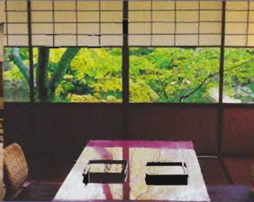
Japanese cuisine (Taiko-en Ryotei Yodogawa-tei)